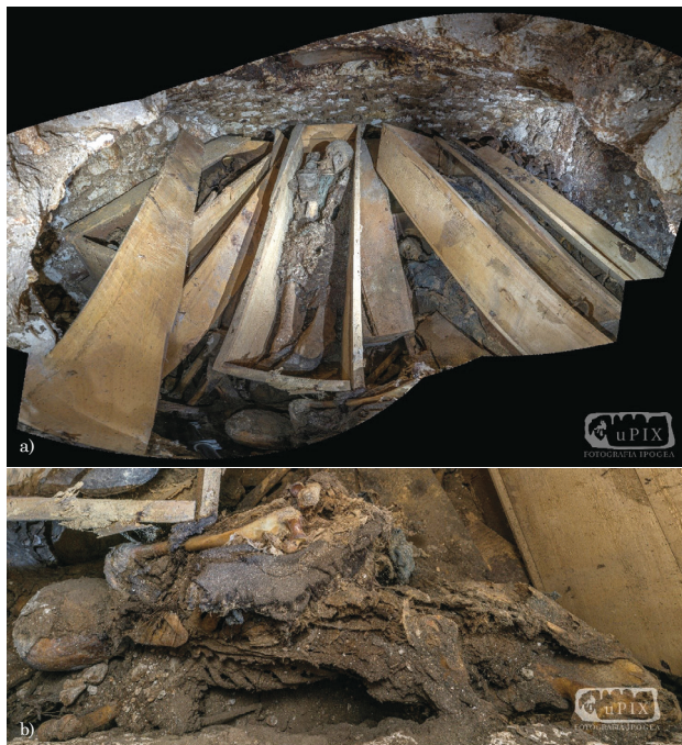
Fig. 3.a) The crypt with wooden coffins arranged in two layers and (top right) sparse bony remains. b) The incomplete mummy near the opening.

was found. In addition to the documentation, these images will permit the definition and design of the extraction activities of the mummies. After a detailed decision involving several experts from different sectors, the best extraction techniques will be defined. Overall, this subsequent activity will take place through speleological techniques, taking into account the stratigraphic relationships typical of archaeological science, to make the exhumation of the mummified bodies less invasive as possible.