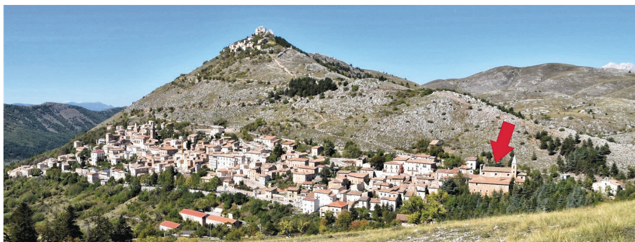
Fig. 2. Calascio and its hamlet Rocca Calascio. Red arrow: the church of Santa Maria delle Grazie.

Due to the low level of the ceiling vaults, the crypt was explored only on the surface, taking pictures by a photography technique commonly used in speleology. Reporting photographs were achieved by placing strategic lighting points (LED lights) that showed the mummified bodies' context and details. The positioning of the lights was carried out, taking care not to alter the environment, as it